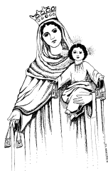
Our Lady of Mount Carmel